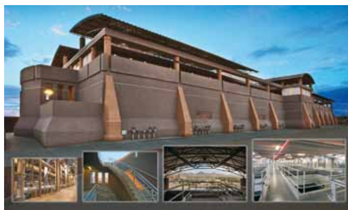
Image of Central Arizona Project Water Treatment Plant's GAC facility

The tour will visit the Center for Environmental Biotechnology in the Biodesign Institute at Arizona State University. The Center performs leading edge research on microbiological means to improve water quality and to produce renewable bioenergy as methane, hydrogen, electricity, or lipids for transportation fuel. The Center has state-of-the-art capabilities for chemical and molecular-biology analyses, and it has bench-scale reactors systems that include microbial fuel and electrolysis cells, methanogenesis, photobioreactors, and membrane biofilm reactors. The Biodesign Institute is an award-winning and LEED-certified research facility designed to support collaborative research that involves biology to address society's challenges of environmental sustainability and human health.